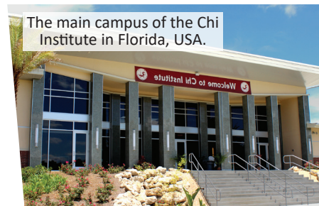
The main campus of the Chi Institute in Florida, USA.

To register: visit www.tcvm.com call 800-860-1543 email register@tcvm.com