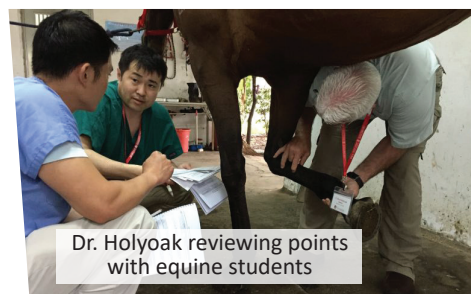
Dr. Holyoak reviewing points with equine students

Single occupancy option: a room with one bed (not two).