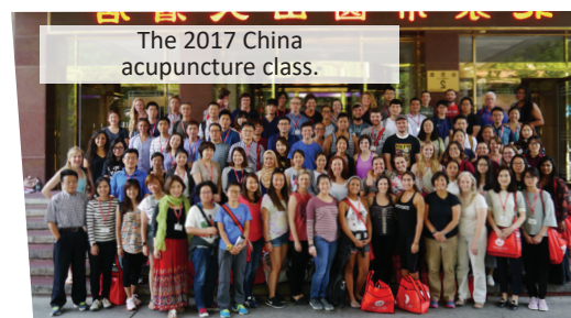
The 2017 China acupuncture class.